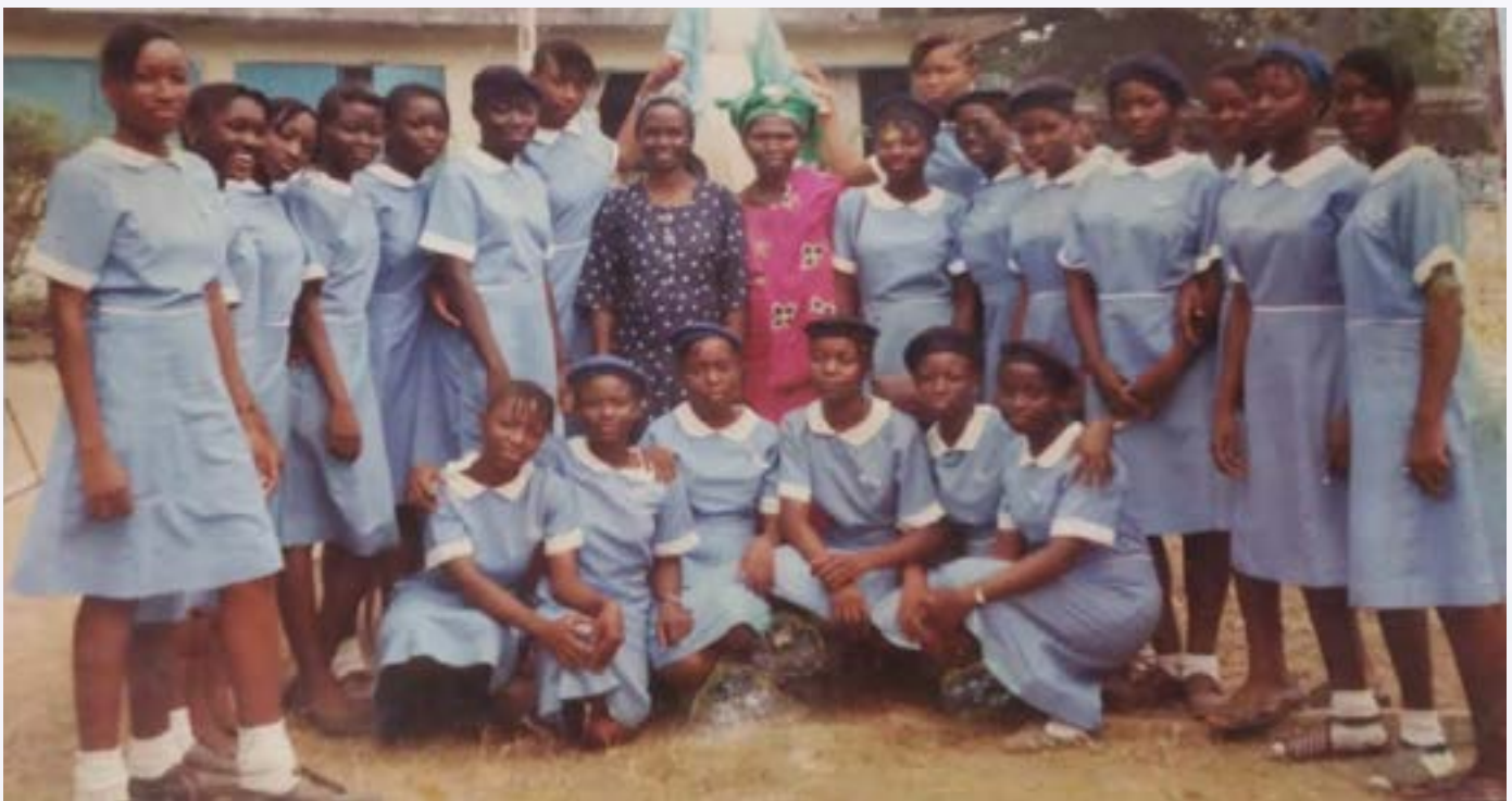
1996 Set Prefects